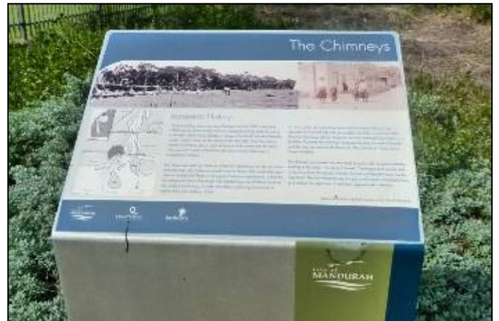
The Chimneys. Descriptive plaque of the area, on a peaceful walkway. This is one of the favourite walks of those people living near the foreshore in Erskine, favoured by dog and nature lovers.

As part of the City of Mandurah's infrastructure works for the 2019/20 financial year the asbestos roof of the old police sergeant's quarters at the back of the museum will be replaced. The replacement will be made from colour-bond steel and require 75mm wide strapping to be placed down the walls of the building in order to secure the roof. This was explained by the structural engineer who is supervising the work as being necessary due to new regulations which require stronger tie downs for roofs as opposed to those originally incorporated into the building. This now needs to be added on the building's exterior whereas when new buildings are constructed the fastenings can be hidden inside walls. The lower weight of the steel roof verses asbestos sheeting makes this even more important.